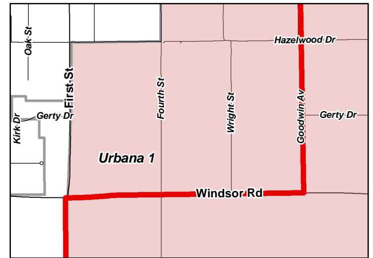
C) County Board 9 & 8 Urbana 1 Split Enlarged